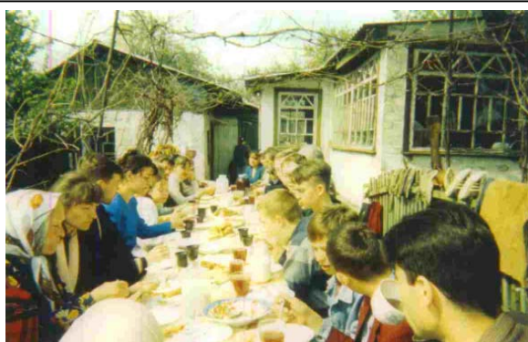
We celebrate together with our fellow Christians of the former Soviet Union who now have opportunity to study Reformed theology and preach the truth of the Gospel like in this Ukrainian village