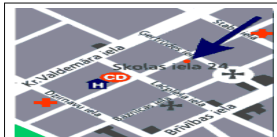
Location of Riga Reformed Theological Seminary. Among economic, political, and worst of all moral corruption this is a unique time for the Baltic States in general and Latvia in particular to turn to the right source for hope and guidance - the Word of God in its pure doctrine of Grace!

Many of the present-day challenges confronting Latvia stem from the period of Soviet control: the economy is weak and struggling to free itself from over-reliance on the Russian economy; the political environment is unstable with many different parties vying for control of