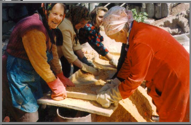
And... the babushkas (grandmothers, 72+ years) who invest their lives in His Church - even making and hauling bricks - "to build their church..." "to possess their land" (Josh 1)