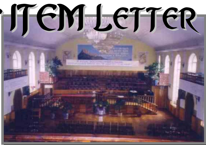
First Homiletics Conference was held in this church, they are ready for another, and only the funds fall short...

Donetsk Regional Theological College will graduate 28 students with Bachelor of Theology degrees and 24 with Bible Certificate degrees in June of 2001! The denomination with whom we co-labor at that college has designated our efforts there to be the training facility for its pastors in all of the Eastern half of Ukraine—the spreading of the truths of scripture as contained in the doctrines of Reformed Theology have not only permeated the “grass roots”—pastoral level, but are now rising