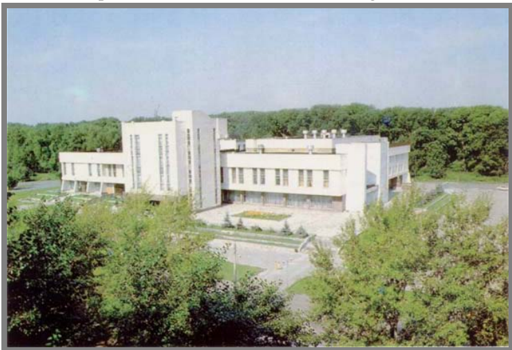
In Tyumen, Siberia, a facility for students is available. Reformed theology can be taught when the money for registration and rent are raised.

necessary to accomplish a successful registration with the government, procurement of facilities, and designation