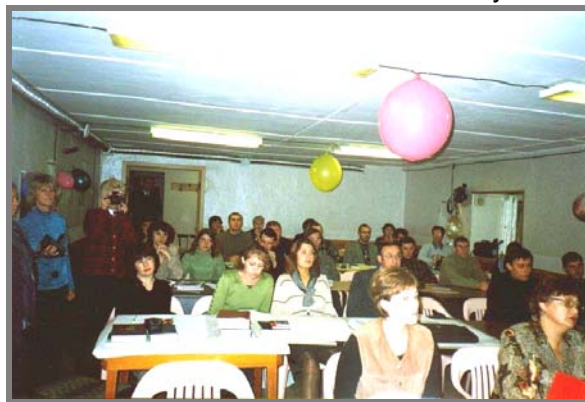
Classes are well under way at the Tyumen Bible College