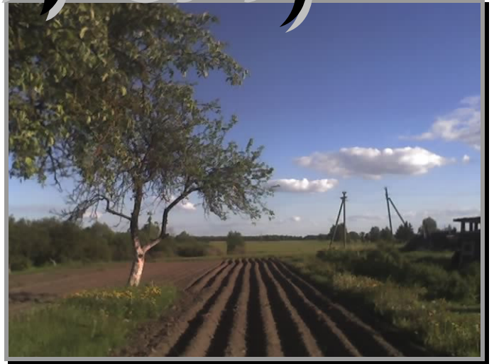
Then he said to his disciples, "The harvest is plentiful but the workers are few. Ask the Lord of the harvest, therefore, to send out workers into his harvest field." Matthew 9:37-38