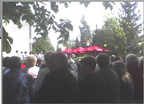
Picture to the right shows an annual village festival on Pentecost five hours of songs and poetry south of Vilnius, Lithuania. Below (left): graduation day at Kiev Bible College. Below (right): Kiev Sunday evangelical outreach in a Ukrainian village of 100 where the gospel has never been heard before.