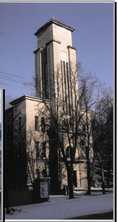
Reformed church in Kaunas, Lithuania