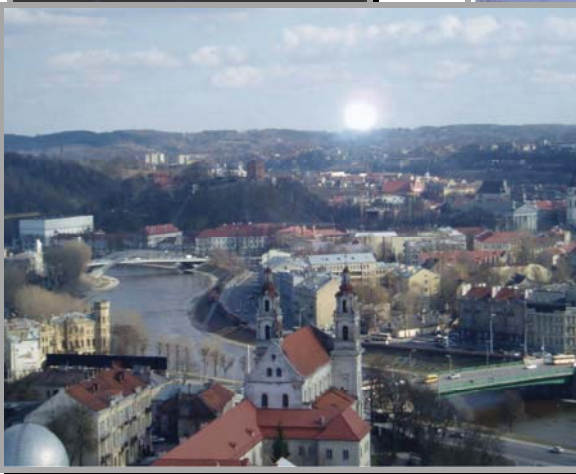
Vilnius, the capital city of Lithuania